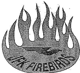
Logo C- White, Gray shirts ONLY