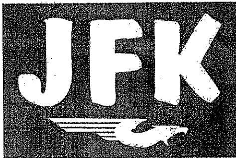
Logo B- Gray, Navy, White shirts ONLY